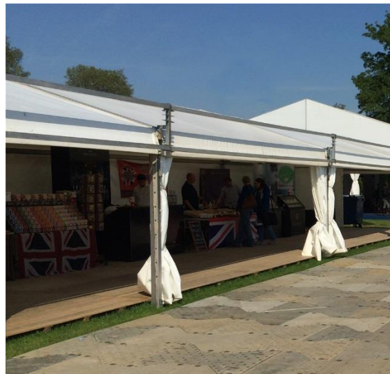
Ivory pleated roof and wall linings