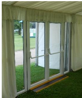
White, PVC, lockable doors with panic bolts.