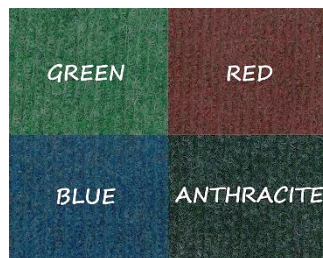
Carpet is available in blue, green, red and anthracite (other colours available on request).