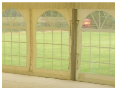
Optional window walls available.