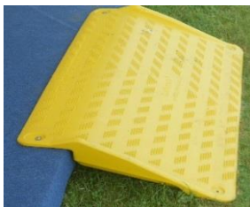
High visibility disability ramp

The integral banner rail system (600mm high) gives a professional finish and provides exhibitors a safe method of attaching signage.